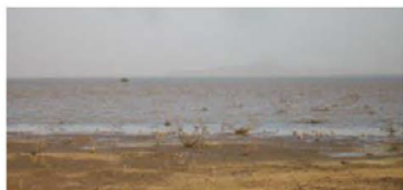
Receding lake water in northern Mali.