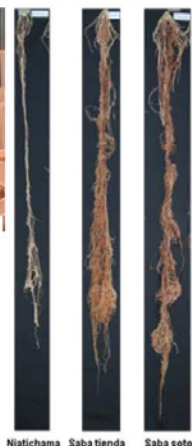
Niaticama Saba tienda Saba soto